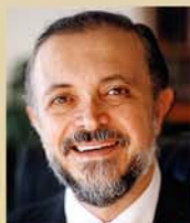
Mario J. Molina Nobel Laureate 1995