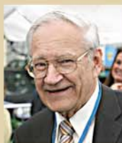
Richard R. Ernst Nobel Laureate 1991