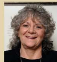
Ada E. Yonath Nobel Laureate 2009

Mark your calendars now and plan to celebrate with us at IUPAC 2011!