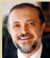
Mario J. Molina Nobel Laureate 1995