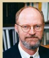
Robert H. Grubbs Nobel Laureate 2005