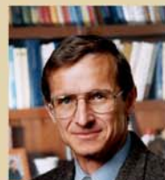
Richard R. Schrock Nobel Laureate 2005