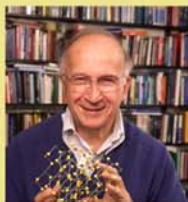
Roald Hoffmann Nobel Laureate 1981